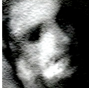
Figure 2 : The face on Mars as a family photograph (2).

"...the essence was not to be degraded, her face was not to have any reality except that of perfection, which was intellectually even more formal. The Essence became gradually obscured, progressively veiled with dark glasses, broad hats and exiles: but it never deteriorated." (Barthes , 1957)